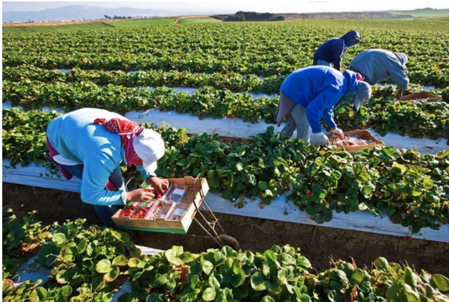
Strawberry picking by Mexican workers.